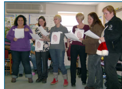
Staff from the Whitby office show their creativity with a song at the agency Christmas party & United Way auction.

For these staff, providing a service is more than following a protocol, a plan, or recording a statistic. It's a commitment to caring for the community we live in. It's a desire to help lift someone up from the depths of what seems like a bottomless and dark place. This is what drives our staff.