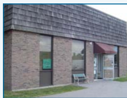
Whitby—105 Consumers Dr. 905-666-8847

EFFECTIVE, JUST AND HUMANE RESPONSES TO CRIME AND ITS CAUSES.